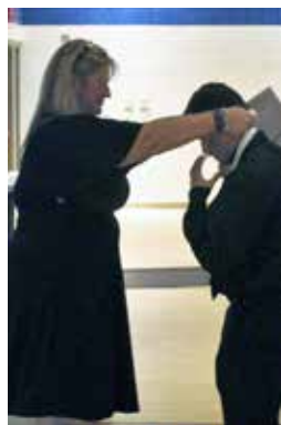
The Spirit of Austin Awards Dinner also included the senior awards ceremony.