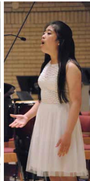
Austin's Band and Choir at St. Isidore Church for the Spring Concert and Graduation.